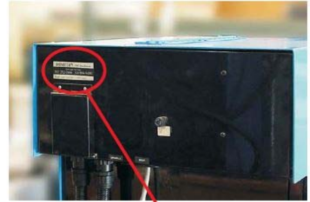
G2 CNC Serial Number