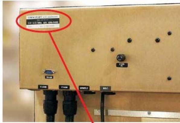
G3 CNC Serial Number