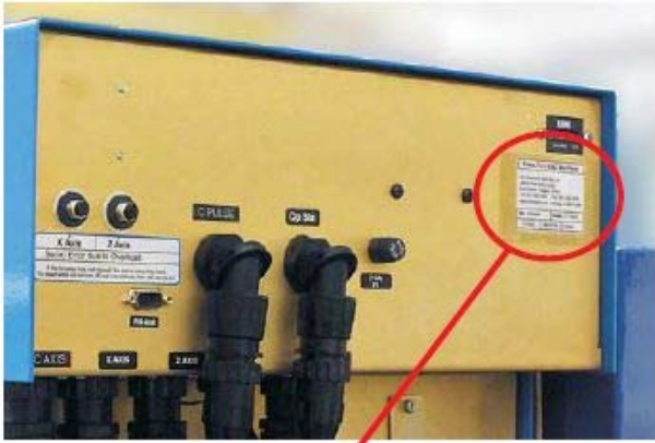
G4 CNC Serial Number